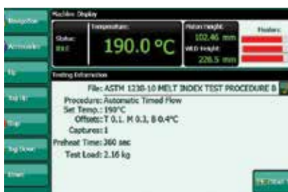
Home screen for MP1200M motorised