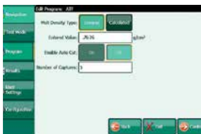
Program creation screen for automatic time flow and time basis tests.