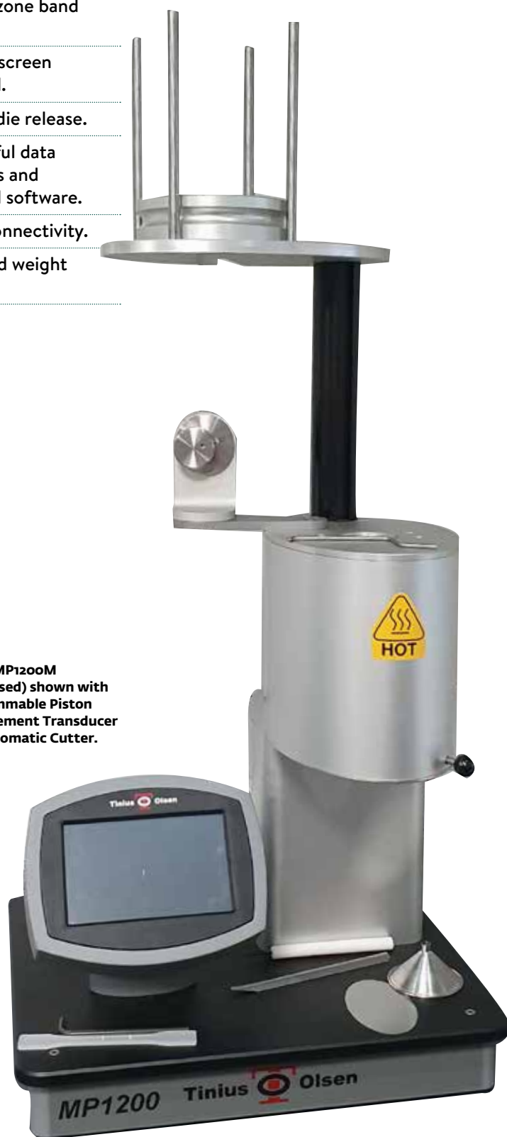
Model MP1200M (motorised) shown with Programmable Piston Displacement Transducer and Automatic Cutter.