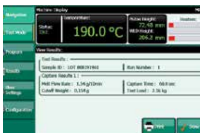
Test result screen.