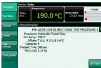
Home screen for manual MP1200